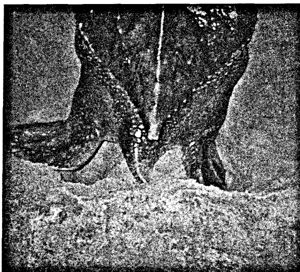
Figure 2. Leatherback turtle at Awala-Yalimapo, French Guiana, digging a double-chambered nest cavity on 4 April 2001.